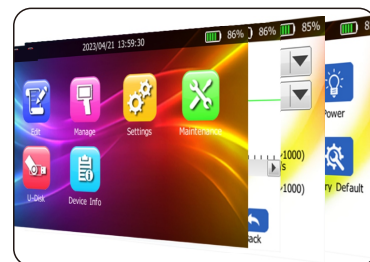
User-friendly 5" HD touchscreen, intuitive software.